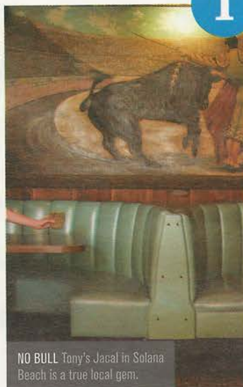
NO BULL Tony's Jacal in Solana Beach is a true local gem.

When it comes to favorite Mexican haunts in North County, you're either a Tony's Jacal ( tonysjacal.com ) devotee or a Fidel's fan. Our dedication is with Tony's. The 1946 restaurant, replete with a saloon and festive terrace, is a family-owned Solana Beach charmer. Newcomers: Expect a sense of discovery, and don't expect chicken. The house specialty is roasted turkey, and guacamole has never been so heavenly. The margie and roving mariachi are calling your name.