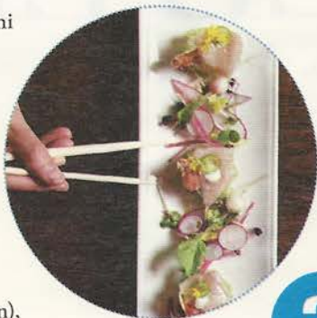
RAW DEAL The sushi bar at Market Del Mar

There's sushi, and then there's sushi at Market Bar + Restaurant ( marketdelmar.com ), the favorite North County staple is getting a long-needed remodel just in time for race season. The nightly offerings are all about freshness, and the be-seen bar is as scene-y as it gets. Across the way (in what has previously been a doomed location), don't rule out Sublime Ale House ( sublimealehouse.net ) for a more casual setting—and lots of craft beer.