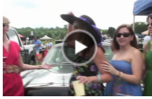
Steeplechase 2011: Elaborate tailgating