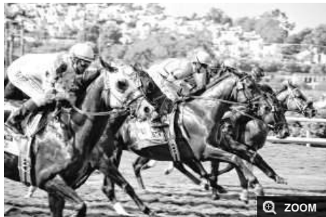
Catch the excitement of Del Mar's races, July 20-Sept. 7.

plan to be there for closing day festivities on Sept. 7. In between, it is always in style to don a hat, but try to catch a Friday night concert