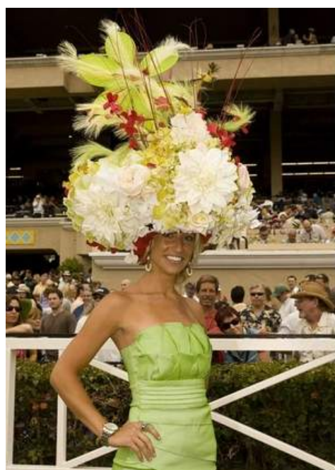
Be a part of Del Mar's Hat Contest on Opening Day at the races, July 20.