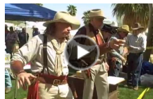
Fast-Draw Wild West Shootout