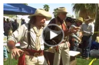
Fast-Draw Wild West Shootout