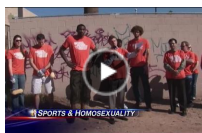
Suns CEO says he's gay