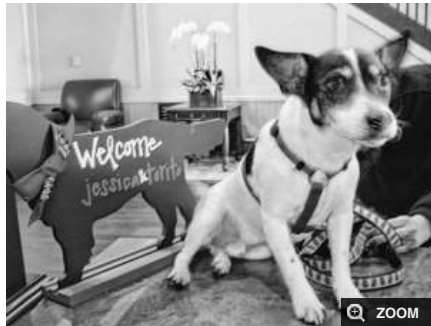
Torito checks in to West Inn in Carlsbad.

Two-legged guests are not the only ones who thoroughly enjoy their stay at Fess Parker's Doubletree Resort, directly across the street from a soft, sandy beach and the sparkling Pacific in Santa Barbara. The 24 lushly-landscaped acres have walkways with "pet posts," and each guest room has a private balcony or patio. All pets are greeted with a special amenity bag upon arrival; an in-room pet menu is both "pawriffic" and "purrific."